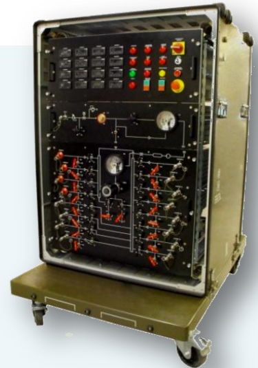
HP filling bench DAMIS-400-16 nitrogen / 400 bar / 12+4 HP lines