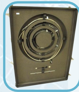
12 flexible hoses included in covers